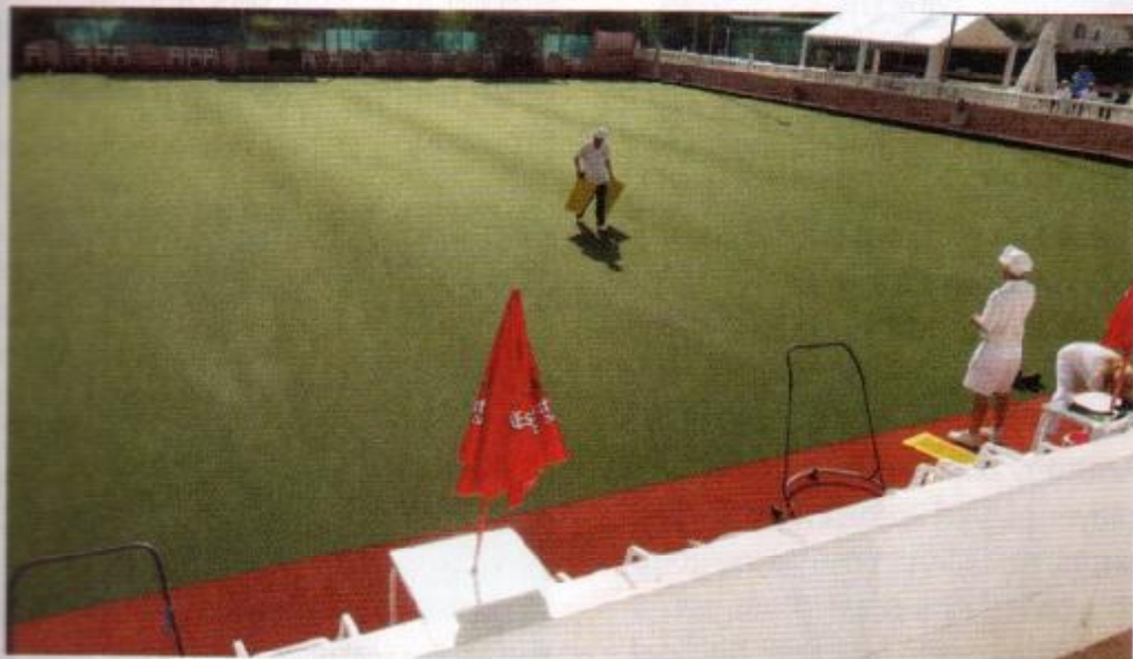
Emerald Isle Bowls Club will be one of two clubs hosting the European Championships.

against some of the top international sides whilst testing themselves in the three formats.